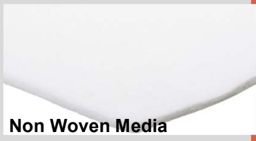
Non Woven Media